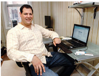
Farriella for News